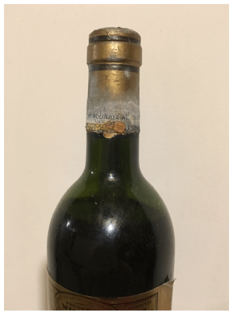
Storing wine in uncontrolled environments causes damage to the seal, which can lead to oxidation of the wine, decreasing quality and value.