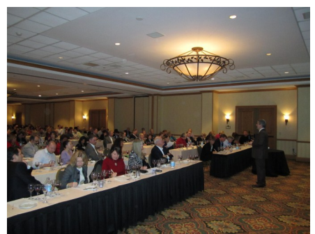
Views of WAG's Wine Tasting in Orlando