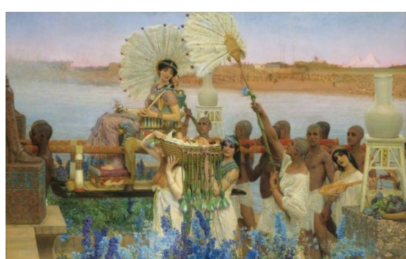
Sir Lawrence Alma-Tadema, "The Finding of Moses," 19 th century, image courtesy of Sotheby's